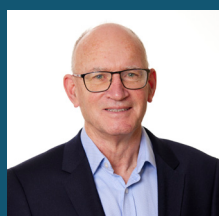
Neale Coleman CBE